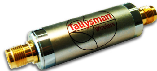
TW125 Dimensions (mm)

Its low loading allows for both the antenna and the TW125 in-line amplifier to be powered by the GNSS receiver. The TW125 passes DC supply to the antenna, therefore not requiring additional hardware such as bias-T, power cable and power supply.