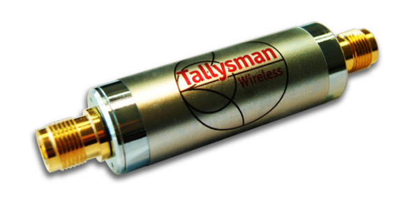
TW141 Dimensions (mm)

The TW141 passes DC directly from input to output to support centre conductor DC supply to the antenna, and so avoids the need for an additional bias source or bias "T". It is enclosed in a robust weatherproof cylindrical nickel-plated brass housing (IP67 compliant) and is available with SMA and TNC female connectors.