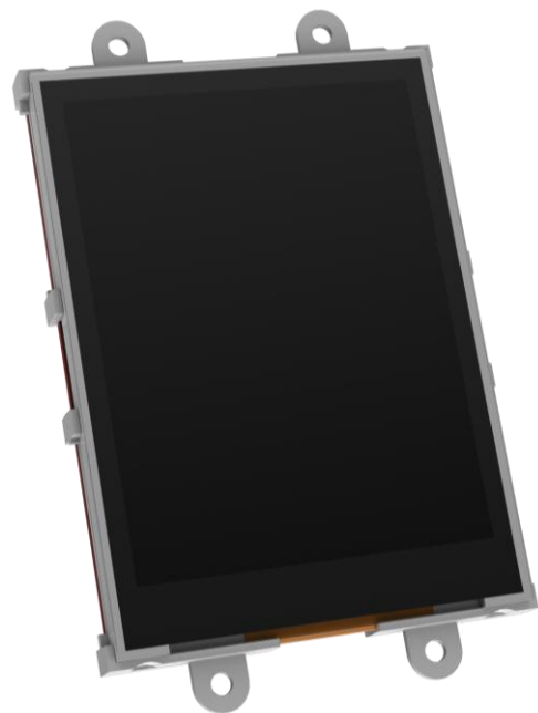
The uLCD-28-PTU Display Module