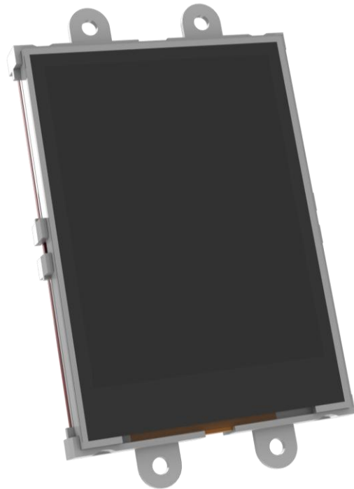
The uLCD-24-PTU Display Module