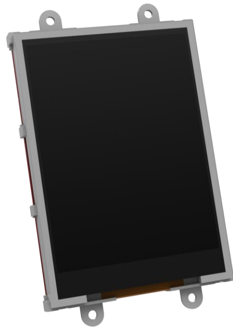
The uLCD-32-PTU Display Module

For a detailed listing of the serial commands available, please refer to the Appendix section of this document.