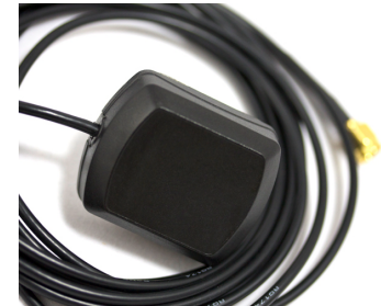
Image does not reflect the actual size of the antenna