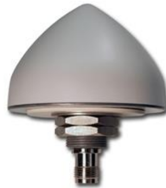
TW3010/TW3012 Dimensions (mm) Conical Radome shown. Flat Radome also available