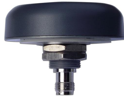
TW3320/TW3322 Shown with Low Profile Radome. Conical Radome also available

The TW3320/3322 is housed in a permanent mount industrial-grade weather-proof enclosure. Two options for pole mounting are available an L-bracket (P/N#23-0040-0) or a pipe mount (P/N#23-0065-0)