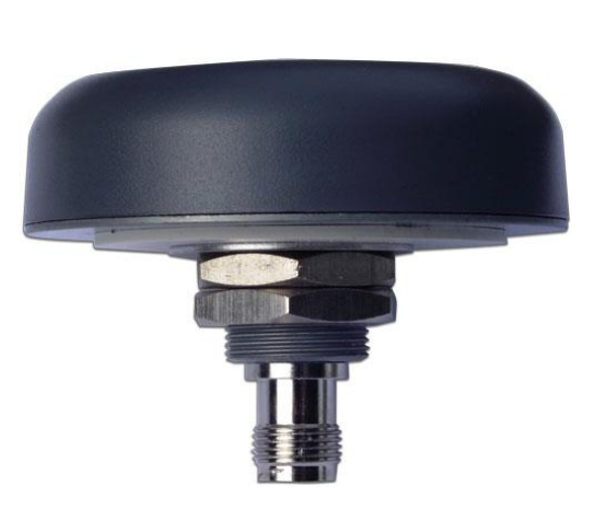
TW3710 / TW3712 Dimensions (mm)