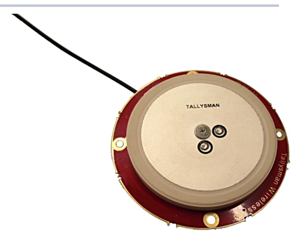
TW2106 Dimensions (mm)