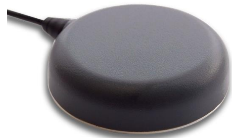
TW2600A Dimensions (mm)

The TW2600A is housed in a compact, industrial-grade weather-proof, magnet mount enclosure, with threaded base holes for screw down attachment.