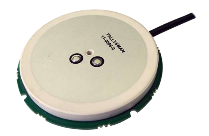
TW2605 Dimensions (mm)