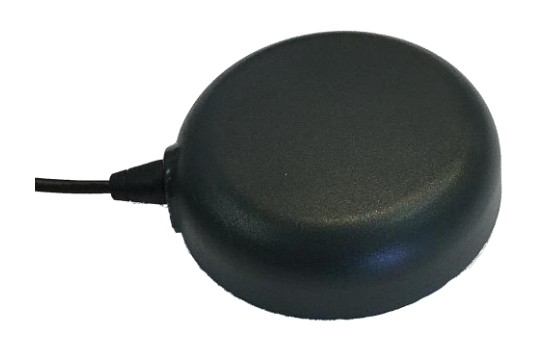
TW7876 Dimensions (mm)

The TW7876 provides reception for signals in the bands 1257MHz to 1300MHz and 1557MHz to 1606MHz. It is housed in a magnetic mount, weather-proof enclosure.