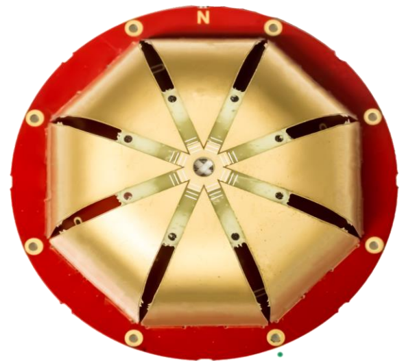
90 mm ground plane shown

The unique features of the VeroStar™ antenna guarantee it can deliver high signal-to-noise ratio (SNR) and highly accurate and precise code and phase tracking of GNSS signals from all elevation angles in the most challenging environments.